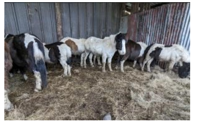
15, 16 & 17