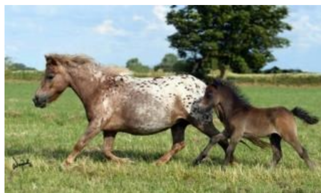
Hattie (foal not included)