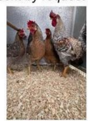
on behalf of Lincs Poultry & Waterfowl

Held in accordance with current APHA Rules