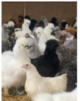
on behalf of Anglia Poultry

Held in accordance with current APHA Rules