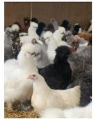
on behalf of Anglia Poultry

Held in accordance with current APHA Rules