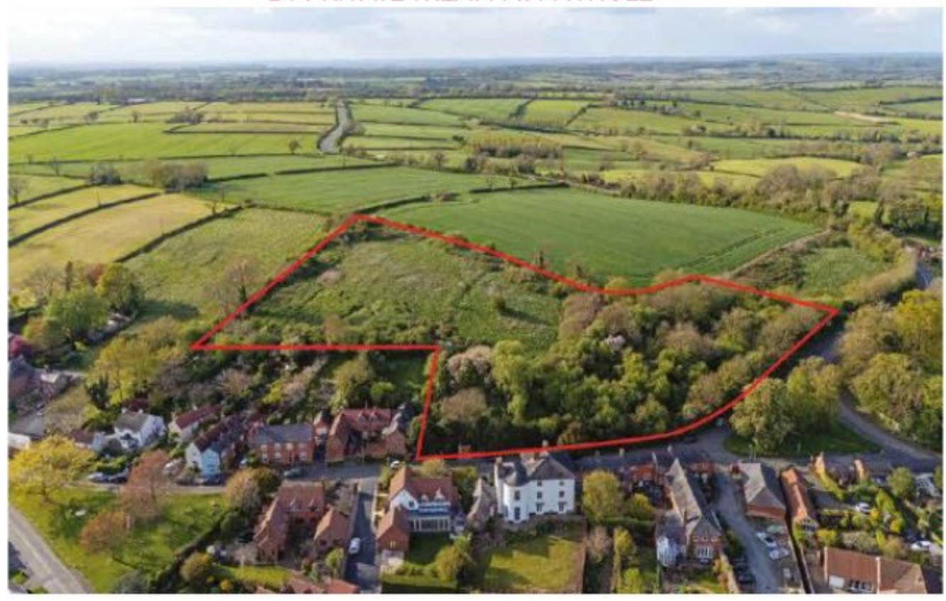
Land at Top Green, Upper Broughton, Melton Mowbray, Leicestershire

The land is situated in the attractive village of Upper Broughton, in the county of Leicestershire, approximately 7 miles away from Melton Mowbray. The land extends to approximately 3.78 acres (1.53 hectares). The land benefits from a rural but accessible location and is approximately 2 miles from the A46, which leads to central Leicester and Junction 21a of the M1 motorway.